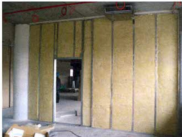
Example of use Isover ORSET