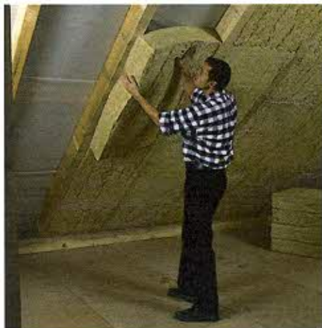
Example of use Isover ORSIK

Dimensions of Isover ORSIK: 1200 x 600 mm Dimensions of Isover ORSET: 1000 x 625 mm