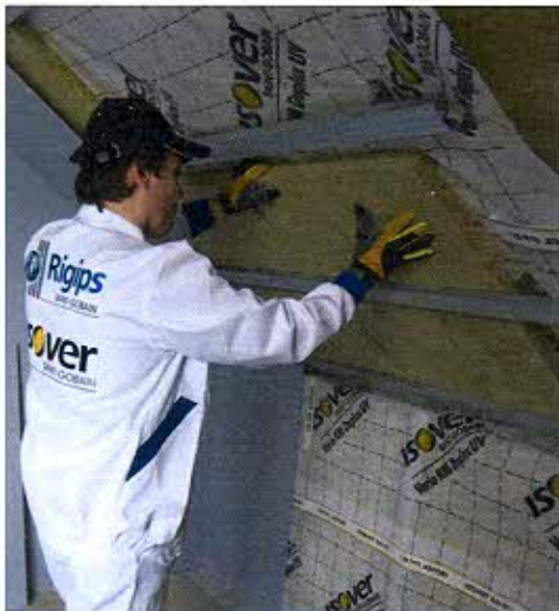
Example of use Isover TOPSIL

Isover TOPSIL slabs are suitable for unloaded insulations of the outer walls (ventilated facades under the cladding with insulant inserted into cassettes or frames), insulation of the pitch roofs, ceilings, false ceilings and other light sandwich constructions. The material is suitable for fire protection partition walls where the density \geq 60 \text{ kg.m}^{-3} is required.