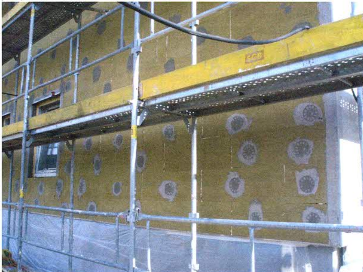
Example of use Isover NF 333.

Isover NF 333 slabs are suitable for ETICS facade systems where the insulating slabs are fully glued on a sufficiently flat and bearing surface. The layers of contact insulating systems are applied on the slabs: bond, reinforcement grid, penetration, plaster, and paint. Smaller slab size and perpendicular orientation of fibres enables matching to curved surfaces. Furthermore, there is possibility to regrinding slabs surface for keeping its smooth face. There are lesser requirements for the mechanical bond due to full gluing (see manufacturers of the ETICS system anchors for recommended bond plans).